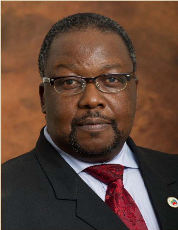
Hon. Nkosinathi Nhleko Minister of Public Works

It is an honour to pen the message for this inaugural publication and support the resolve to broaden stakeholder engagement. I wish to congratulate the Council for the Built Environment (CBE) on this initiative aimed at encouraging dialogue and information sharing to refocus us on deepening transformation.