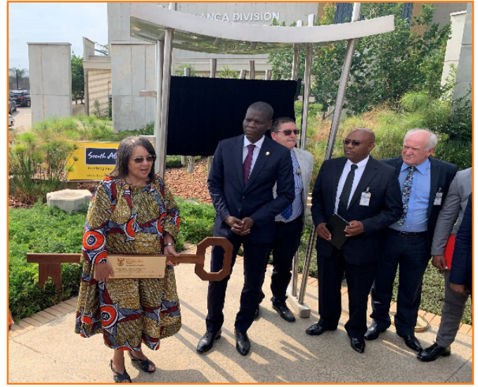
Mpumalanga received its first High Court recently. The impressive R1.2 billion facility (left) was opened by President Cyril Ramaphosa and handed over to the community by Minister of Public Works and Infrastructure, Patricia de Lille (right).